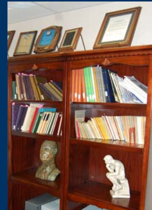
The Georgia Rooms