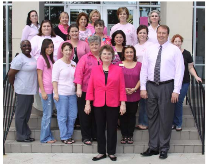
Students and members of the SGC faculty and staff donned pink attire to show their support for Passionately Pink Day in Douglas October 27, promoted by a local charitable organization to raise awareness for breast cancer.