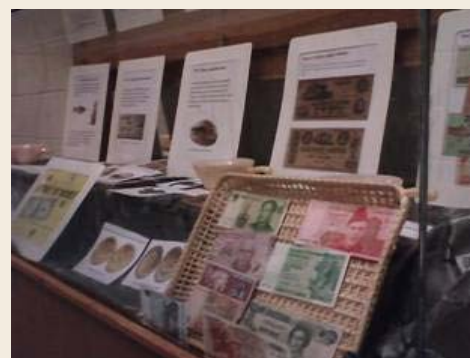
STORY OF MONEY