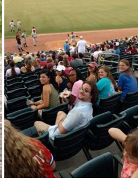
Students and staff enjoy a Jacksonville Jumbo Shrimp baseball game.