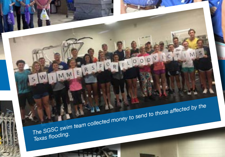
The SGSC swim team collected money to send to those affected by the Texas flooding.