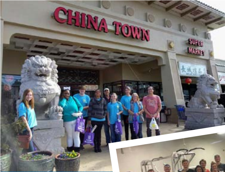
The Cultural Exchange Club celebrated the Chinese New Year in Chinatown of Atlanta.