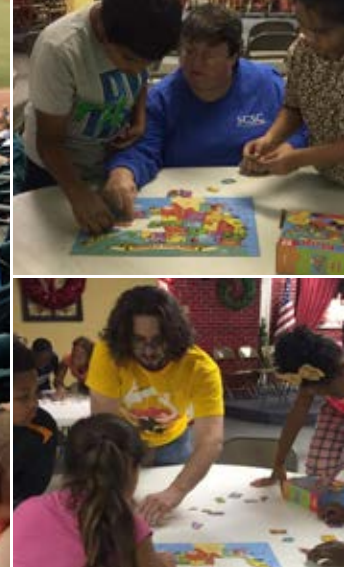
Students enjoy putting a United States puzzle together.

The Cultural Exchange Club is active on and off campus. Faculty advisors plan events such as Hootenanny, a field day of fun for students. They also take the group on educational trips like the one in Atlanta to celebrate the Chinese New Year in Chinatown. The Environmental Awareness Club advisors take students on field trips to Sunbelt Greenhouses and Okefenokee Swamp Park and spend time with elementary and middle school students at the Boys and Girls Club in town.