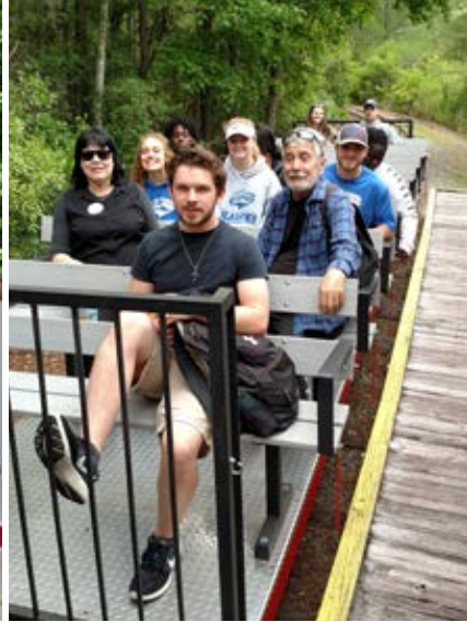
Students explore Okefenokee Swamp Park on the train that runs through the park while exploring the natural environment.