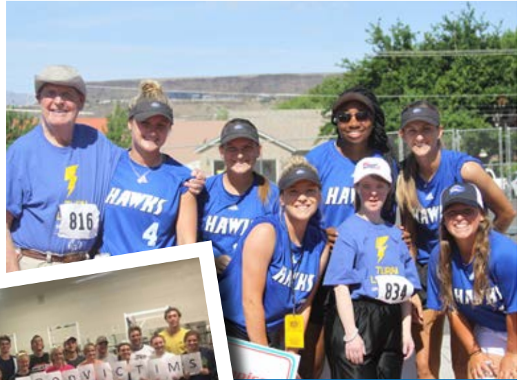
The Lady Hawks softball team volunteered at Special Olympics Utah while at Nationals.