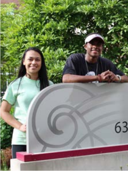
Phi Theta Kappa Honor Society students attend conferences and leadership institutes such as the one at Loyola Lake Shore in Chicago during the summer.