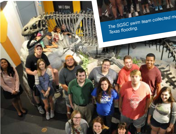
Students in the STEM Center went to the Museum Live! at the Jacksonville Museum of Science and History.