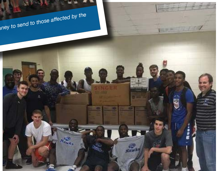
The SGSC Hawks basketball team answered the call from a Texas coach to send shirts and shoes to those affected by the flooding.

South Georgia State College (SGSC) students discover some of their most transformative experiences happen beyond the classroom walls. Because of this, the faculty and staff create ways of facilitating these experiences to offer academic and personal growth and maximize their time on campus. Regardless of their career path, students find activities that fit with their interests or cause them to stretch beyond their limits and try something new.