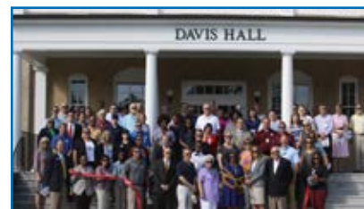
Guests gather on the steps of the newly renovated Davis Hall to celebrate the ribbon cutting.