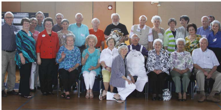
Classes of the 1950's enjoyed a luncheon and fellowship in the Clower Student Center during their Alumni Reunion on April 11.

The alumni classes of the 1950's enjoyed a great time on Friday evening, April 11 at a "meet & greet" held at the Hampton Inn of Douglas. The group gathered again on Saturday, April 12 for lunch at the Clower Center on SGSC's Douglas Campus and enjoyed a wonderful time of memories and fellowship.